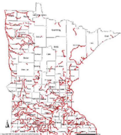
STATE OF MINNESOTA